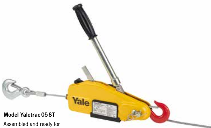
Model Yaletrac 05 ST Assembled and ready for operation (installed)