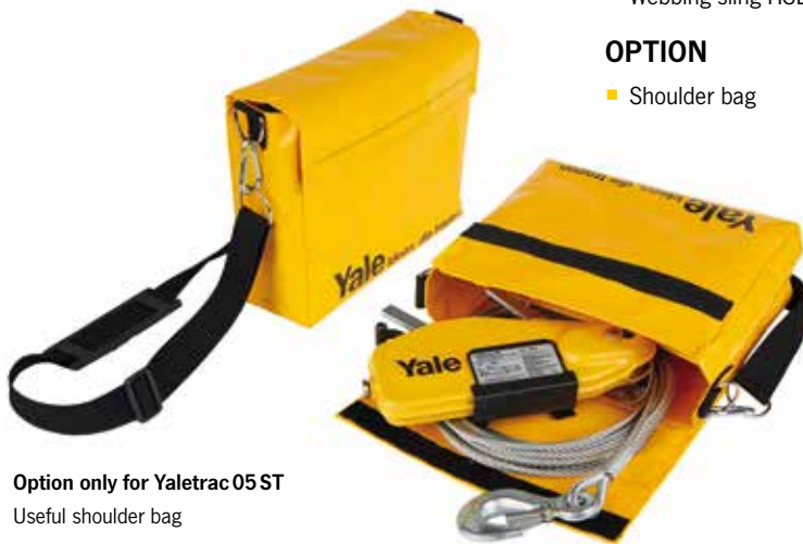
Option only for Yaletrac 05 ST Useful shoulder bag